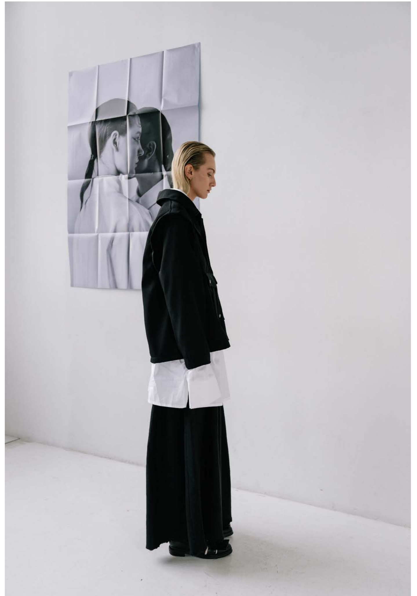
FW24JACKET01 - FW24PANTS02 - FW24SHIRT02