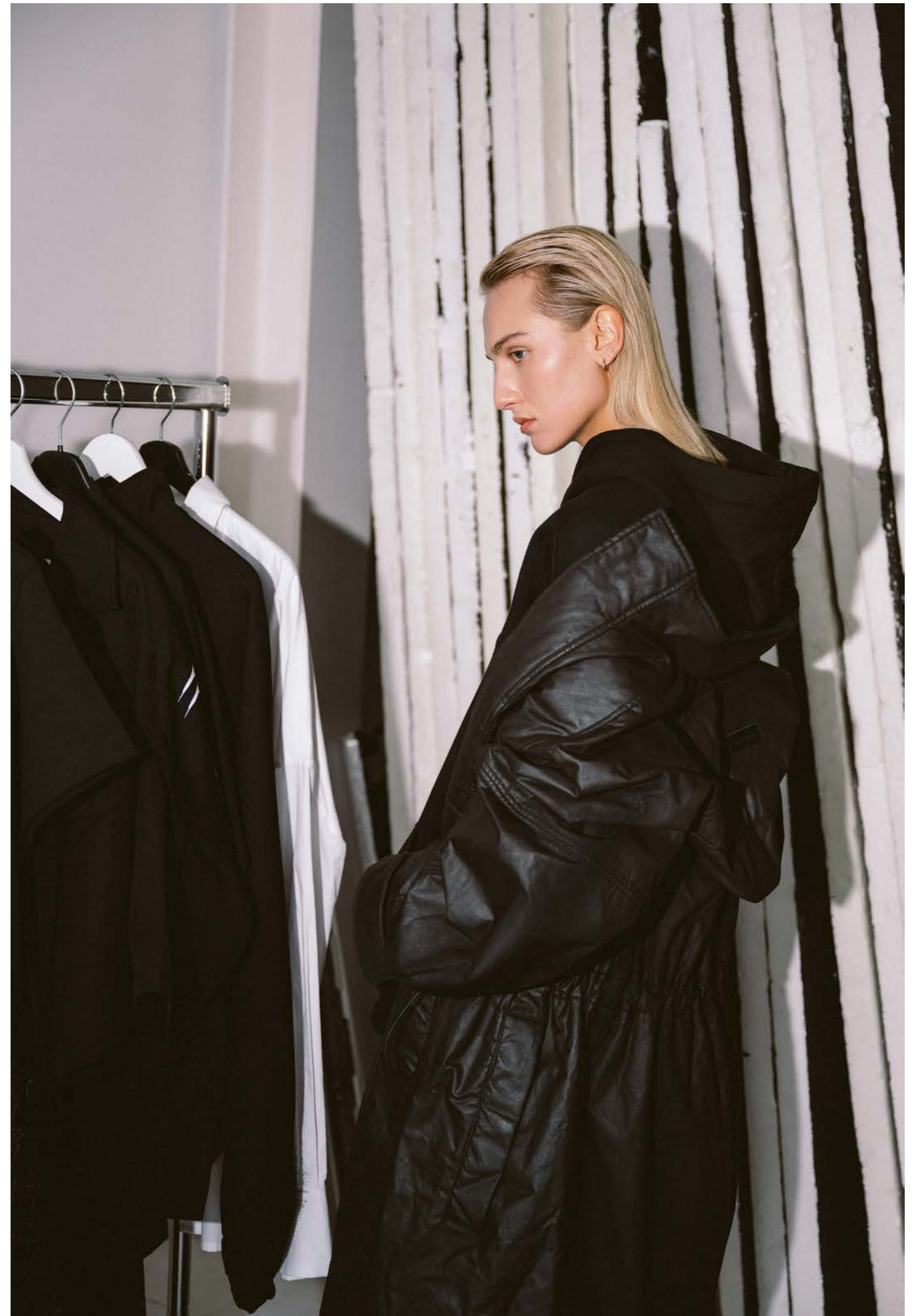
FW24JACKET03 - FW24PANTS03 - FW24HOODIE01