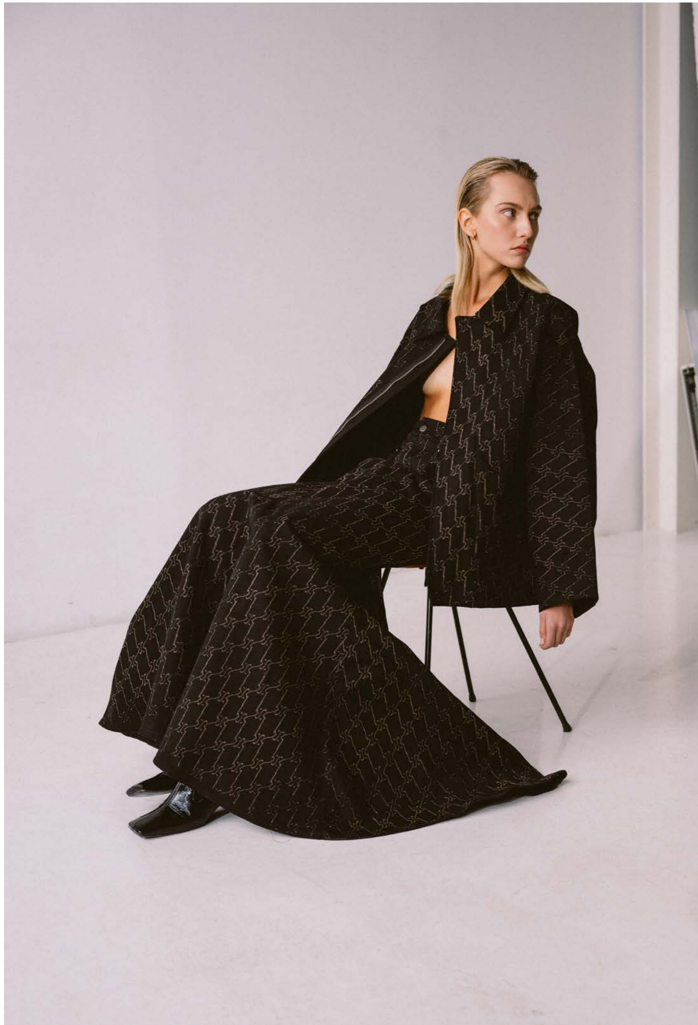
FW24JACKET02 - FW24SKIRT02