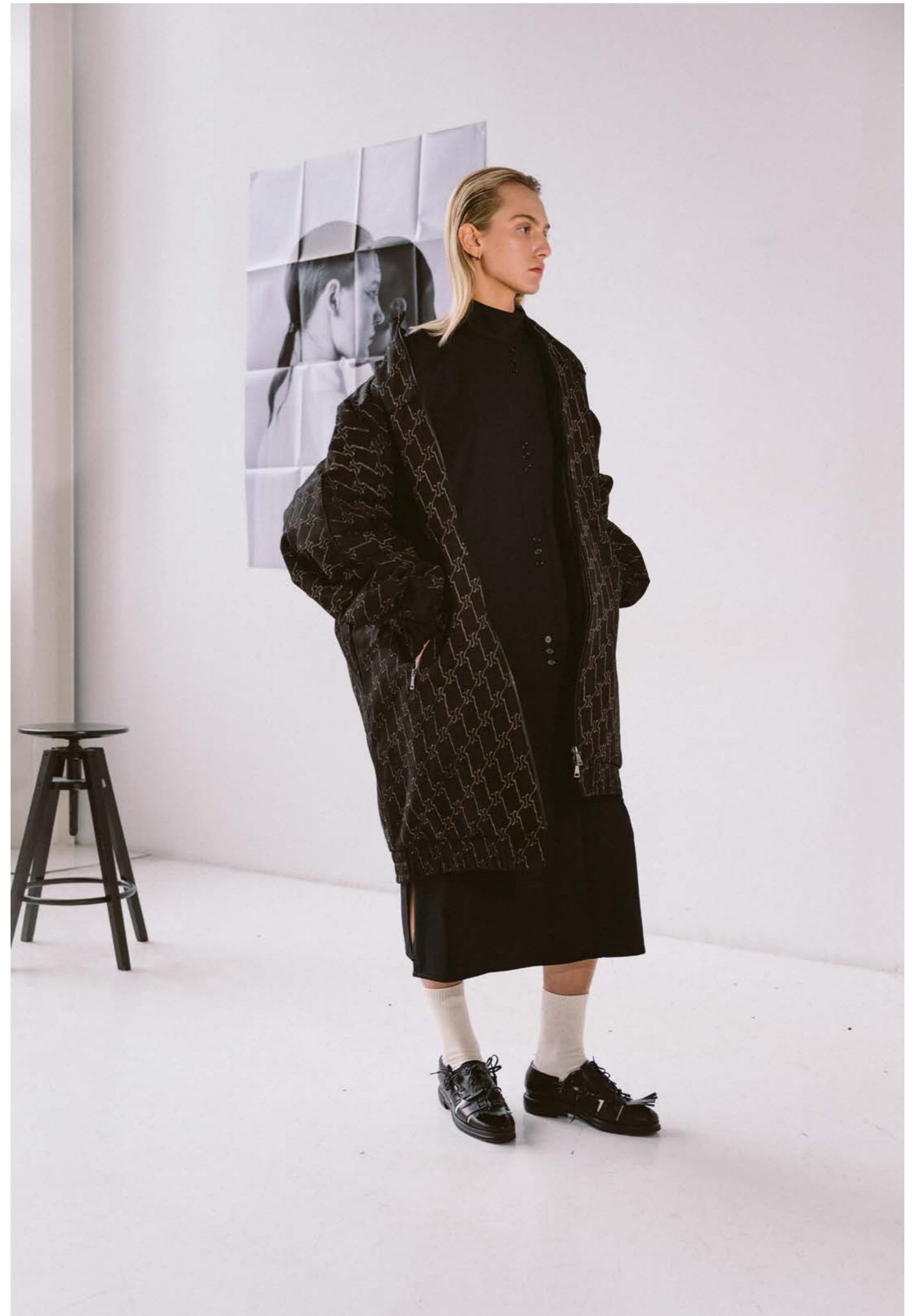
FW24WIND01 - FW24COAT02