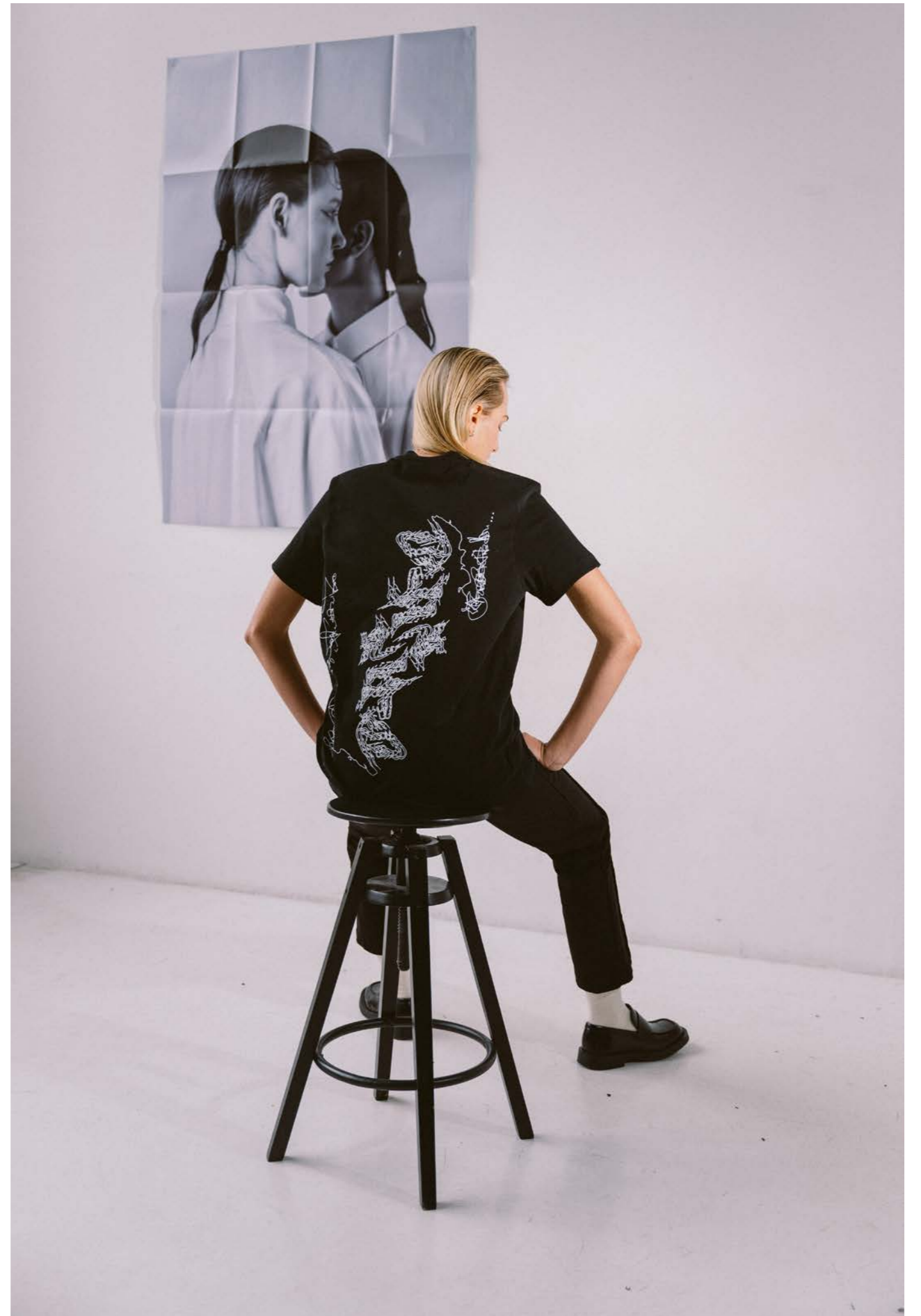
FW24TSHIRT01 - FW24PANTS04